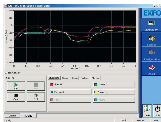
The Graph mode offers unique real-time display of high-speed power-measurement results.

Continuous Sampling Select the required continuous sampling rate (up to 256 Hz with the IQS-1600, and up to 5208 Hz with the IQS-1700).